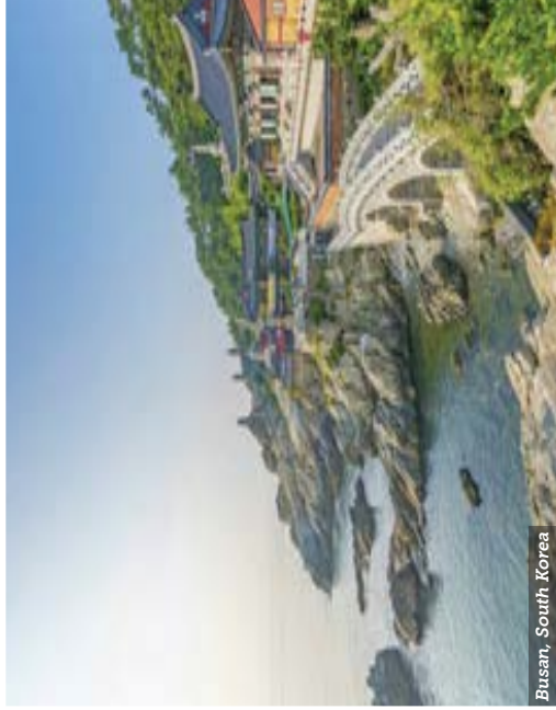
Busan, South Korea

Please contact AHI at 800-323-7373 with questions regarding this tour.