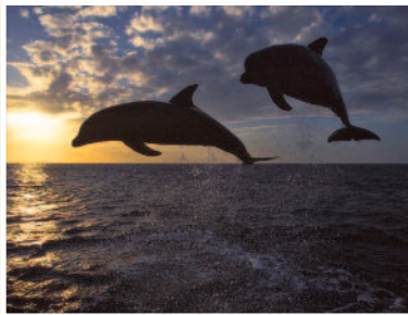
Dolphins, Roatán Island